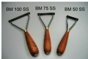
Blade Length x Width x Thickness BM 100 SS 100mm x 14mm x 2mm BM 75SS 75mm x 14mm x 2mm BM 50SS 50mm x 14mm x 2mm