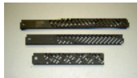
K350S (Large) K300 (Medium) K200 (Small)