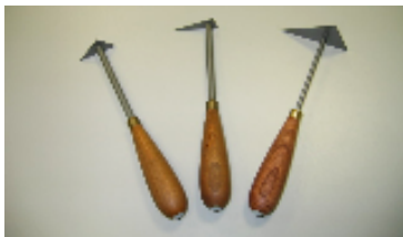
W070D(right) W040F(center) W045E(left)