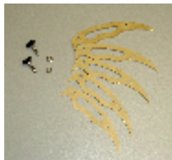
1mm~5mm Thick 5 pc. Set