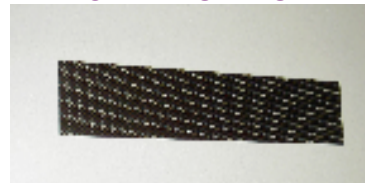
0.5mm x 30mm x 200mm 1.0mm x 45mm x 320mm 1.0mm x 70mm x 320mm 2.0mm x 70mm x 600mm 3.0mm x 70mm x 800mm 4.0mm x 70mm x 800mm 4.0mm x 90mm x 1600mm